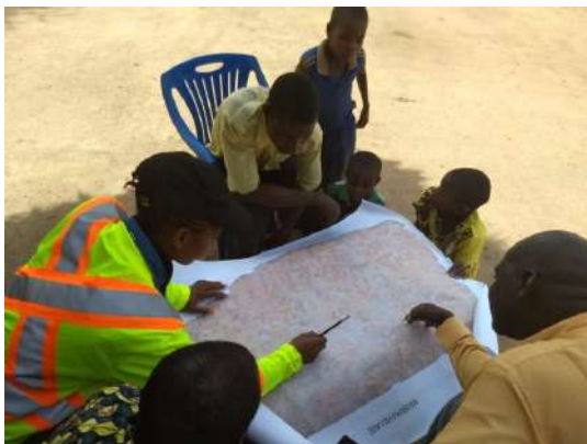
Citizens of Ng'hoboko Village assisting Tanzania Flying Labs and each other to identify their farms