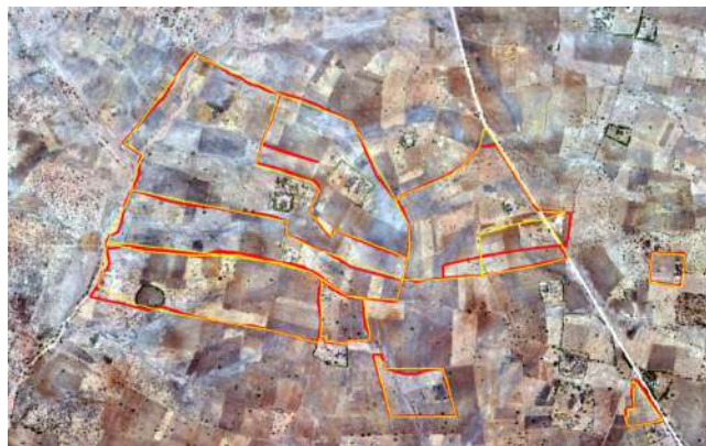
Surveyed farm boundaries on top of an orthomosaic