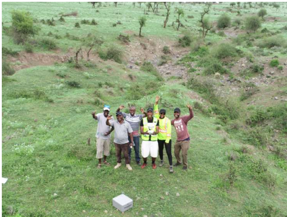
Tanzania Flying Labs team in action