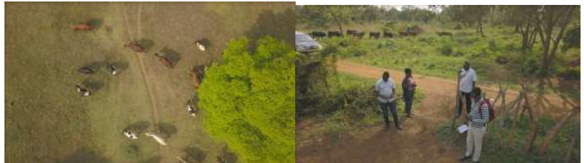
Kakira Farm cattle