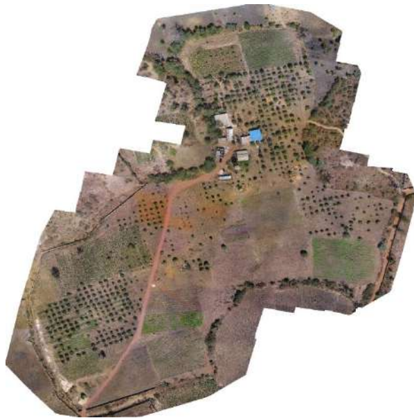
Orthomosaic of the farm