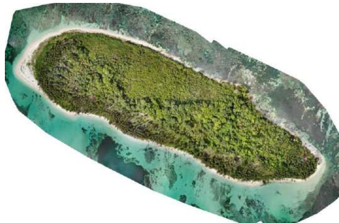
Orthomosaic of Southern Zapatilla Cay

Cayo Zapatilla Norte, Bocas del Toro Modelo de Inundación (1:4000)