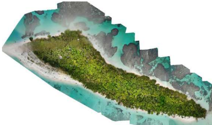
Orthomosaic of Northern Zapatilla Cay