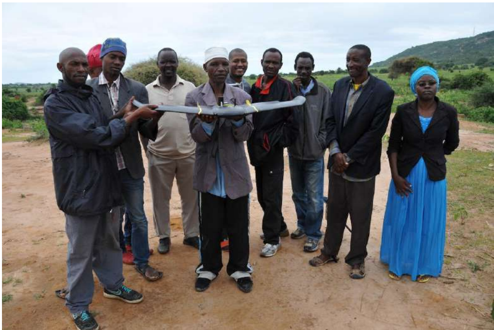
Officials and smallholder farmers of Chandama Village learning more about drones for agriculture