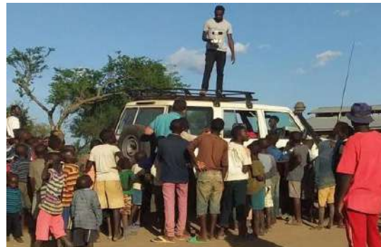
Uganda Flying Labs team surrounded by local community during flight