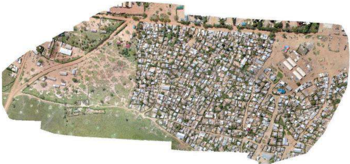
Orthomosaic aerial image generated in Pix4Dmapper