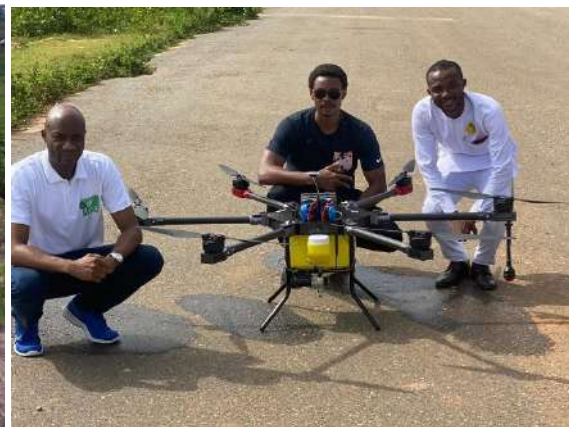
Flying Labs and NACOTAN on field