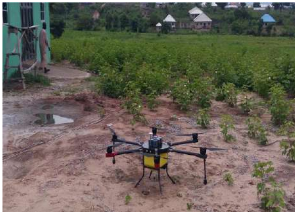
Crop Spraying drone ready to spray a cotton farm