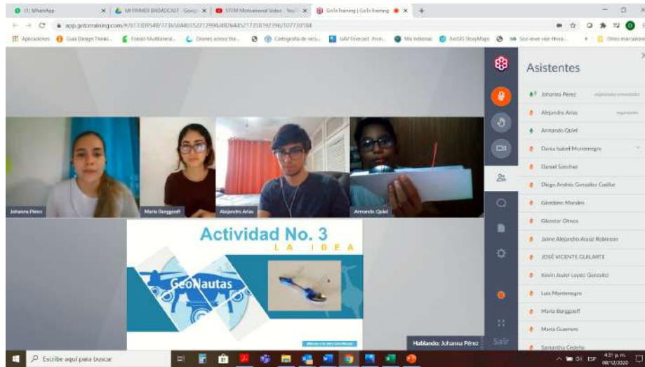
Module one flying test experiment