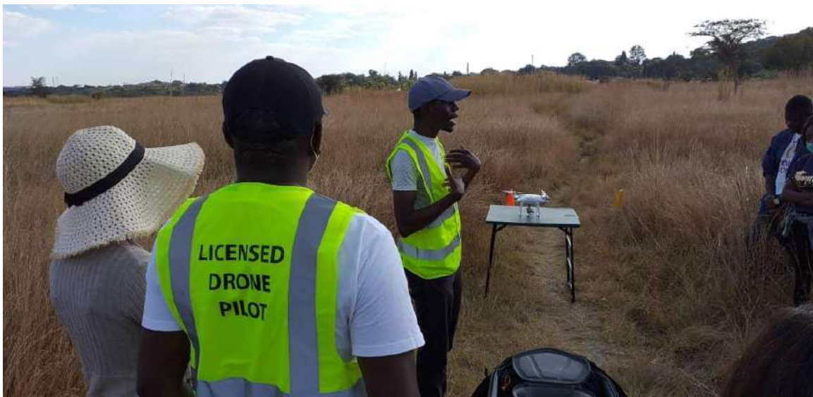
Zimbabwe Flying Labs team during fieldwork