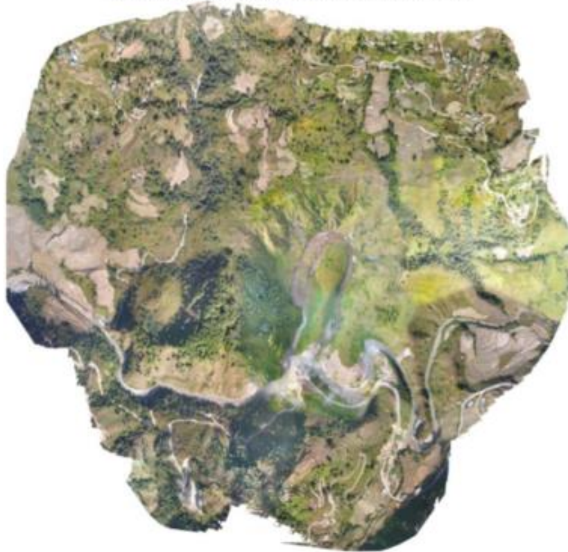
Orthophoto of Bancharedanda and Samyakholcha