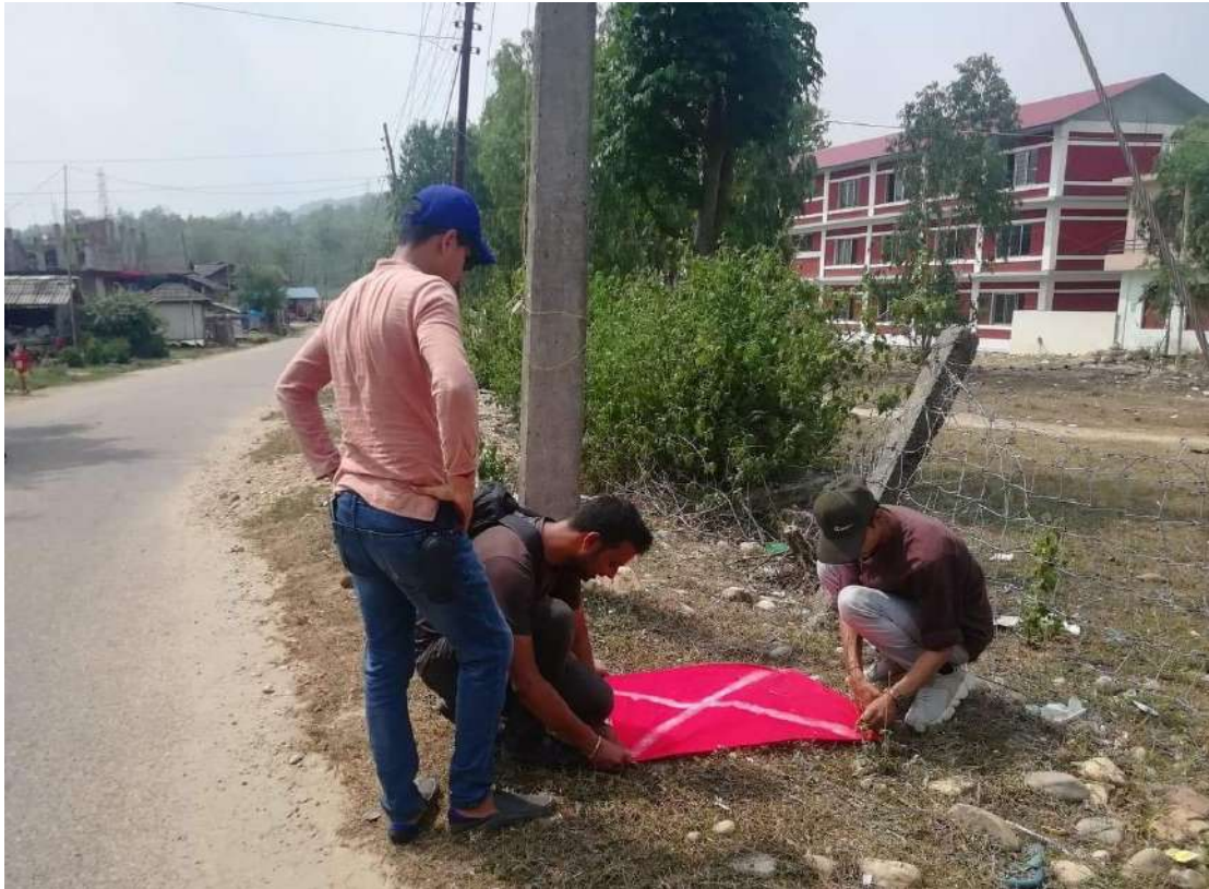
Pilot and GIS team setting up the Ground Control Points (GCPs)