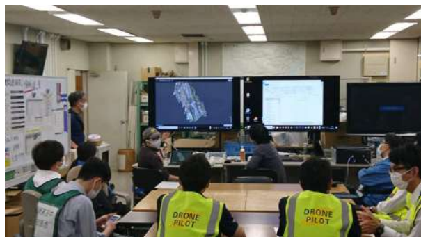
Japan Flying Labs members analyze orthomosaic images with local officials during the disaster drill in Odawara city