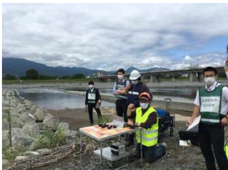
Japan Flying Labs leader operates eBeeX during the disaster drill in Odawara city