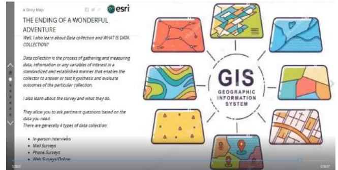
One of the participants Final Presentation