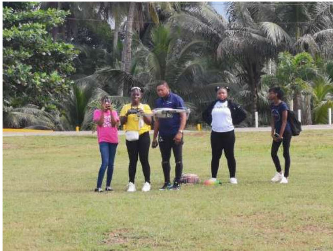
Girls Flying Drone