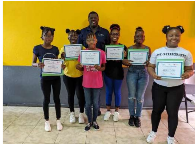
Group of Students from Charlemont High School with their Certificates of Participation