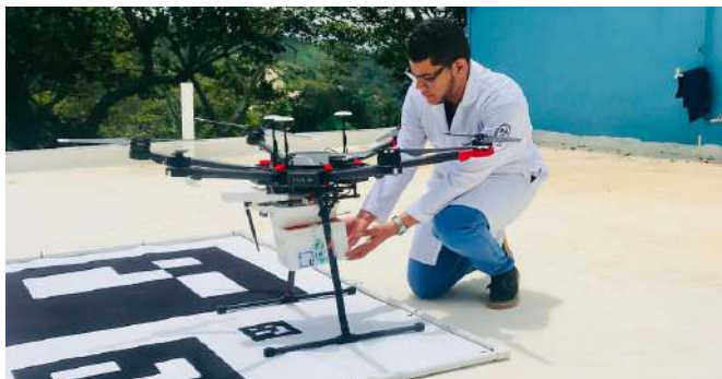
Local doctor removes medicines after drone lands