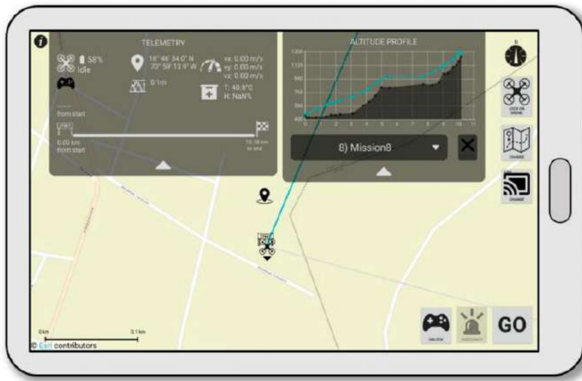
Mission planning software for cargo delivery developed by WeRobotics