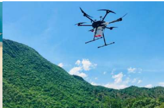
Drone takes off carrying essential medicines